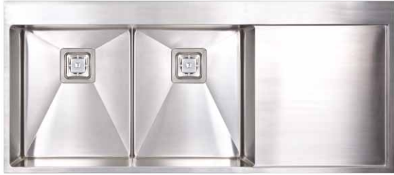
Abovement version with tap platform